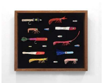
Duke Riley (American, born 1972). Mother Ocean , 2020. Salvaged, painted plastic.

No alterations, overprinting, or color changes are allowed. Full credit and copyright line must be included in the captions.