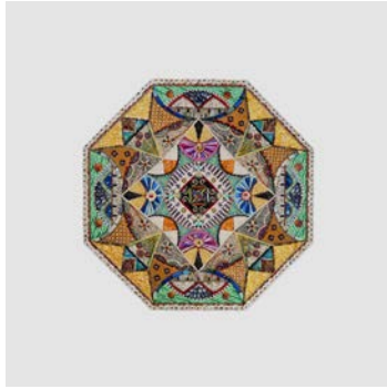
Duke Riley (American, born 1972). I'm Delicious, Come On Get Your Money's Worth , 2020. Found plastic trash, mahogany. Courtesy of the artist. © Duke Riley. (Photo: Robert Bredvad)

No alterations, overprinting, or color changes are allowed. Full credit and copyright line must be included in the captions.