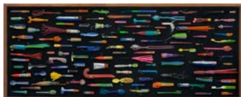
Duke Riley (American, born 1972). Monument to Five Thousand Years of Temptation and Deception (I) , 2020. Salvaged, painted plastic, mahogany. Courtesy of the artist and Praise Shadows Art Gallery, MA. © Duke Riley. (Photo: Will Howcroft for Praise Shadows Art Gallery)

No alterations, overprinting, or color changes are allowed. Full credit and copyright line must be included in the captions.