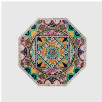
Duke Riley (American, born 1972). Order From Prescription History , 2020. Found plastic trash, mahogany. Courtesy of the artist. © Duke Riley. (Photo: Robert Bredvad)

No alterations, overprinting, or color changes are allowed. Full credit and copyright line must be included in the captions.