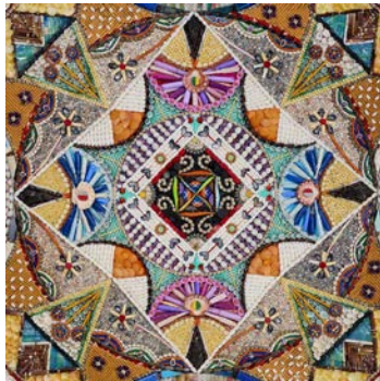
Duke Riley (American, born 1972). I'm Delicious, Come On Get Your Money's Worth (detail), 2020. Found plastic trash, mahogany. Courtesy of the artist. © Duke Riley. (Photo: Robert Bredvad)

No alterations, overprinting, or color changes are allowed. Full credit and copyright line must be included in the captions.